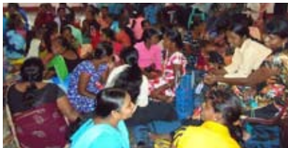
Christians in Sri Lanka find shelter after the recent terrible flooding

Monday 23 Hundreds of thousands of Sri Lankans were forced to leave their homes when extensive flooding swamped parts of the country in January. They had no sooner returned when a fresh deluge hit in