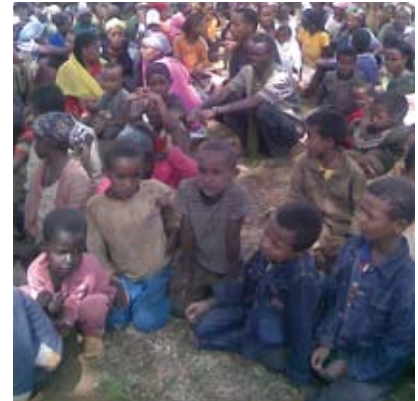
Ethiopian Christians displaced by violence

Wednesday 15 Christians in Ethiopia have expressed concern about what appears to be a campaign to “clear Christianity from the land by (the) sword”. Many fear that the violence in Asendabo on 2 March (see 14 June) was part of this campaign to Islamise the Christian-majority nation and thus gain control of the entire Horn of Africa for Islam. Pray for our brothers and sisters in Ethiopia as they