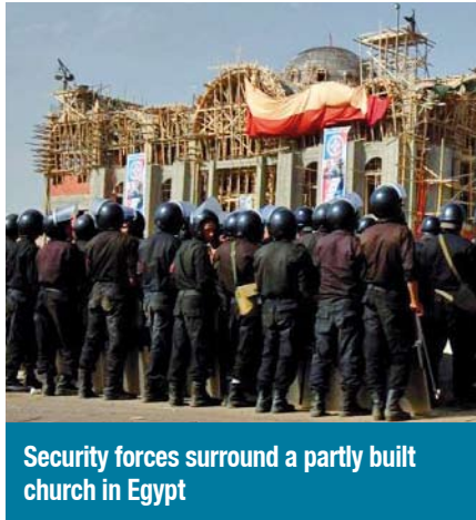
Security forces surround a partly built church in Egypt

were burning down two others. In Egypt, which is notorious for its obstruction of Christian building projects, the security forces stormed a partly constructed church and stopped the work. Pray that the authorities will allow Christians to have adequate places to meet for worship and ministry.