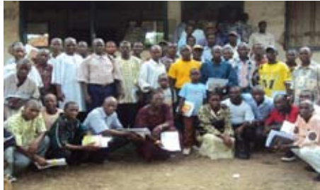
These pastors in Sierra Leone received training and animals from Barnabas

seeds and tools for raising various crops. They were also trained in crop cultivation and animal rearing. Give thanks that these new sources of food and income are giving the pastors the means to continue living in Muslim-dominated rural areas, and pray that the pastors will receive wisdom and discernment as they minister to their congregations and reach out to their Muslim neighbours with the Gospel message of hope and salvation.