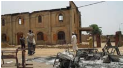
A Nigerian church destroyed in anti-Christian violence

Sunday 14 Mobs armed with machetes and poison-tipped arrows wreaked havoc in the Muslim-majority Northern states of Nigeria following the re-election of Christian president Goodluck