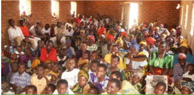
This Tanzanian congregation meets in a church building constructed with help from Barnabas Fund

to worship and proclaim their faith because of government restrictions or lack of meeting space.