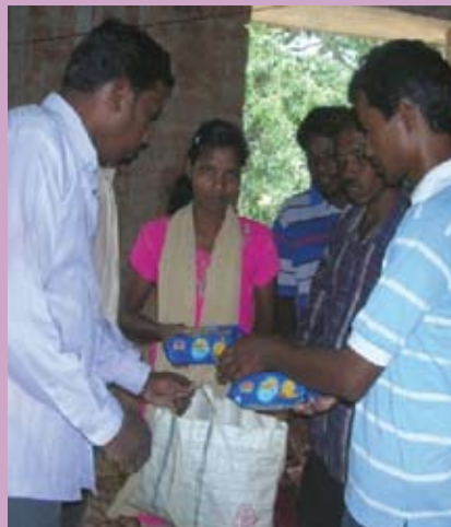
Barnabas Fund aid being distributed in, Kandhamal, Orissa, India

At least 50 Christians were murdered, some burnt alive and others cut to pieces in a rampage of anti-Christian violence in Orissa, India, beginning in August. 300 villages were cleansed of Christians, with homes, churches, relief camps and even orphanages razed to the ground by Hindu extremists . With over 50,000 displaced, Christians wanting to return to their homes have been told, "Come back as Hindu or don't come back at all." Some who dared to return to their villages were forcibly converted to Hinduism. Sometimes the Hindu extremists poured petrol over the Christians and then told them to convert; if they refused they were set alight. Thankfully, 2009 saw a new government, but the threat of Hindu extremism remains.