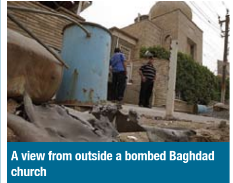
A view from outside a bombed Baghdad church

Authorities in the northern city of Mosul responded to the explosions by introducing temporary curfews in Christian neighbourhoods. Allegedly, this is to provide a degree of protection to the community, but it is unlikely to prevent similar attacks from being staged.