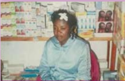
This Angolan Christian needed 20 stitches after a Muslim mob attacked her village