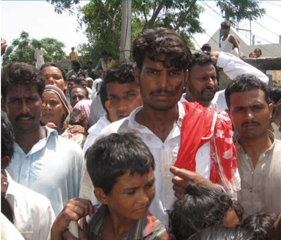
Christian residents of Bahmani Walla, where a 600-strong mob attacked villagers with acid and destroyed over 100 homes