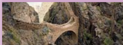
The uplands of Yemen

They all worked for a Christian organisation, and there is concern that they were targeted as an act of revenge for their alleged attempts to convert local Muslims to Christianity.