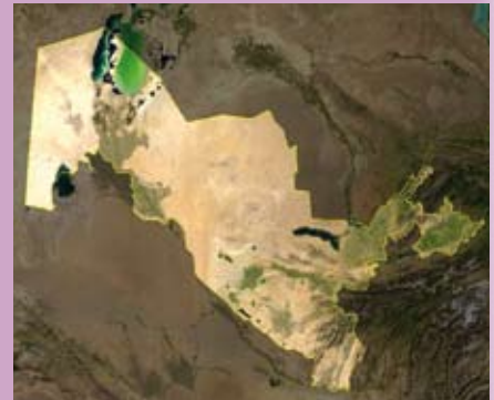
A view of Uzbekistan from space, Karakalpakstan is in the top left corner