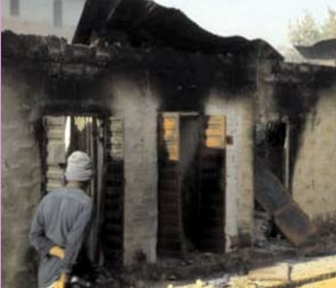
Home destroyed by rioting Muslims, Jos, Nigeria