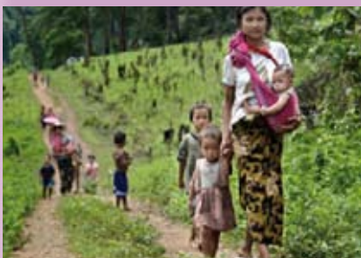
A displaced Burmese family

Since 2 June some 4,000 of the mainly Christian Karen tribe again had to flee to the mountains owing to renewed attacks by the Burmese military. If captured they can be forced to endure heavy labour and even undertake mine clearing duties. The army often sets fire to the villages or plants landmines to kill anyone who returns. As a result many stay in the jungle out of fear, and succumb to starvation , disease or snake bite. As a result of this conflict there are 140,000 refugees in camps over the nearby Thai border.