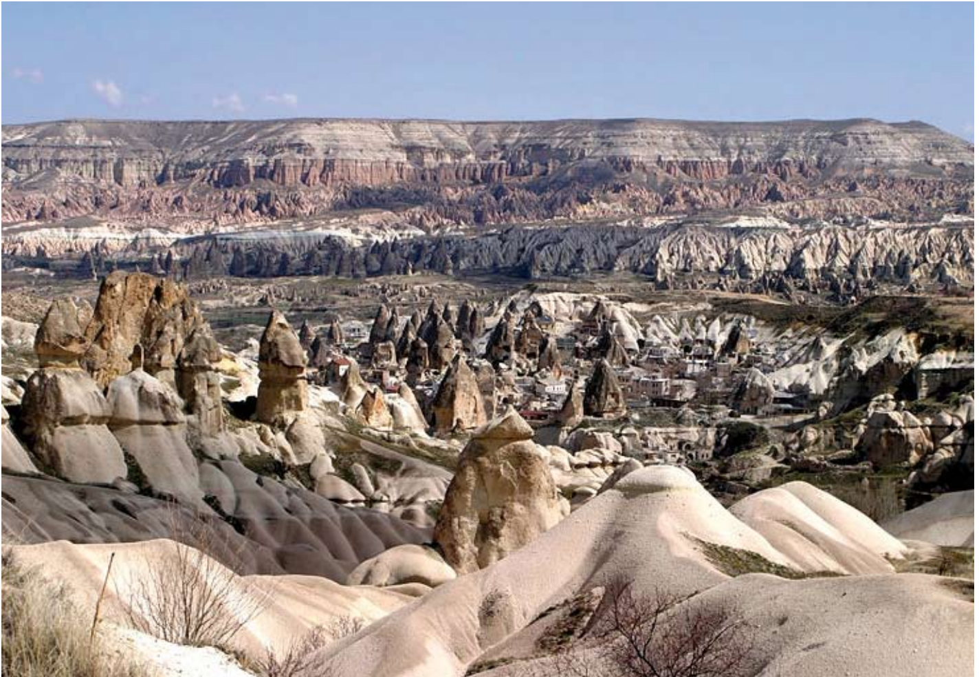
The Christians to whom 1 Peter was written lived in various parts of what is now northern Turkey, including Cappadocia.