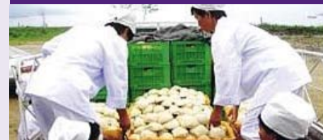
Workers from the Christian-run bakery unload bread