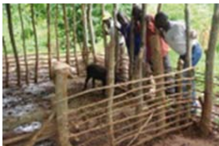
Pigs from the breeding programme that is funded by Barnabas