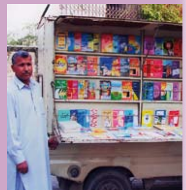
Braving persecution, Christians in Pakistan distribute Gospels and other Christian literature.