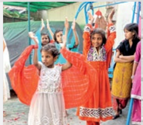
The Abba Home is a place of laughter and new life for 31 orphaned Christian girls