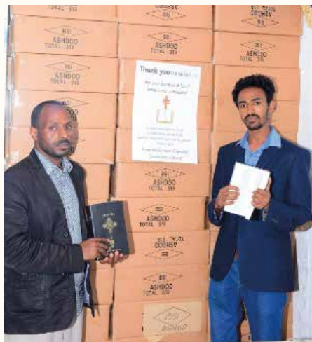
The Bibles in these boxes will bring strength and joy to persecuted Eritrean Christians

spirits”. But the gift of a Bible in their language, Tigrinya, will bring comfort and hope. “I am writing with deep joy and gratitude,” wrote one Eritrean to Barnabas Fund after a consignment of Bibles arrived, “Thank you from the bottom of our hearts.”