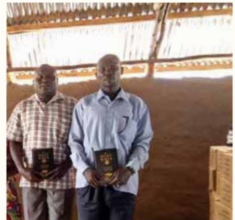
A delivery of Bibles for South Sudanese refugee pastors in Uganda. Previously they were ministering to thousands of fellow-refugees in Uganda without even a copy of God’s Word

or violence, and could not take their Bibles with them when they fled. Some live in countries where the authorities seize and confiscate the Christian Scriptures whenever they find them.