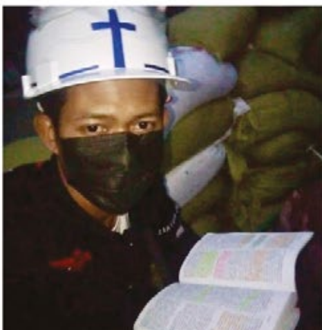
A Karen aid worker shares the Word of God with displaced Christians

A Karen Christian leader who was leading a Bible study in the area at the time escaped with his life. “It was around 7 p.m. when the army jet fighter dropped a bomb just feet away from us,” he recounted. “We ran and the next bomb came even closer. Thank God we survived.”