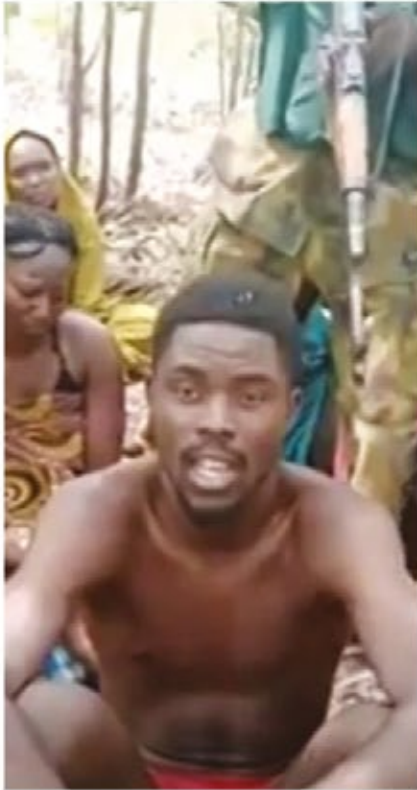
Kidnappers released a video showing students abducted from a Nigerian forestry college held at gunpoint. All the forestry students were eventually freed.

Two Christians were sought out and killed by members of Islamic State West Africa Province (ISWAP) after ISWAP took control of Geidam town in Nigeria's northern Yobe state on April, 23, causing around 2,000 residents to flee.