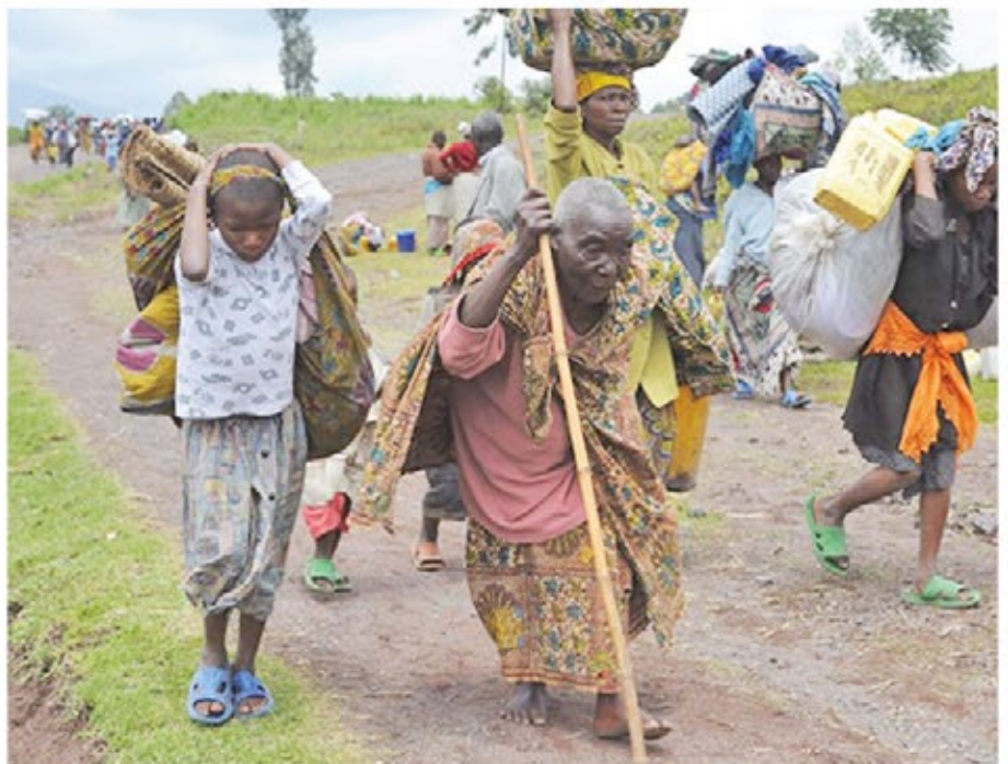
Three-quarters of a million people have fled Islamist violence in the far north of Mozambique.