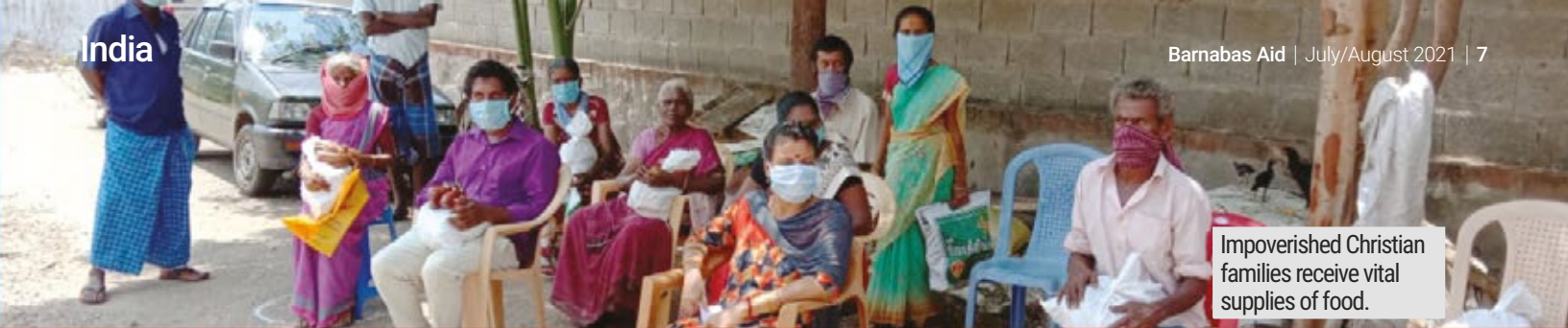
Impoverished Christian families receive vital supplies of food.