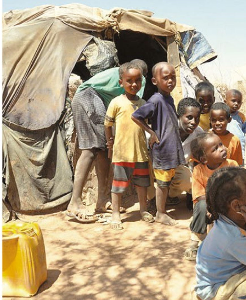
Since an intense wave of terror attacks began in November 2020, thousands of displaced people have taken refuge on the beach at Pemba, the capital of Cabo Delgado, crammed into makeshift shelters.

In Mozambique’s Far North region, nowadays known as the “land of fear,” terror and instability are raging. In this Muslim-majority and resource-rich area of a poor and underdeveloped Christian-majority country, Islamist militants have launched at least 831 attacks since 2017, killing at least 2,658 people.