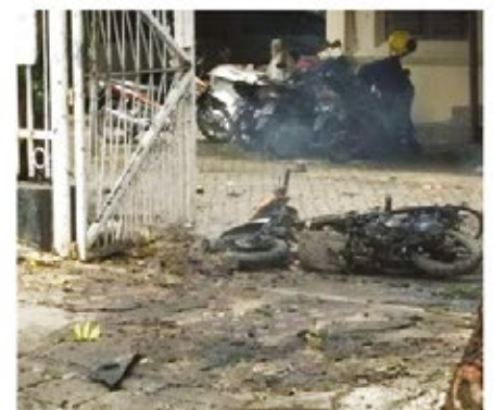
The scene at the side entrance to the church after suicide bombers riding a motorcycle detonated their explosives as Christians inside celebrated Palm Sunday.

Indonesian President Joko Widodo condemned the attack. “Terrorism is a crime against humanity and has nothing to do with any religion,” he said. “All religious teachings reject terrorism.”