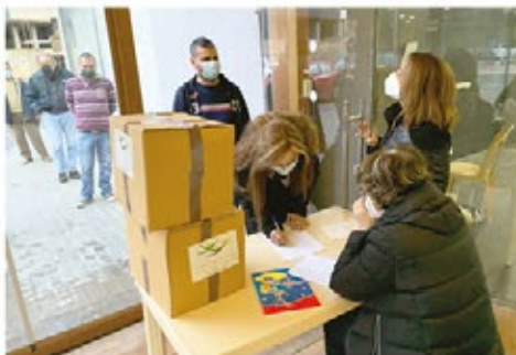
Christians in Beirut sign for food and essential supplies provided by Barnabas.