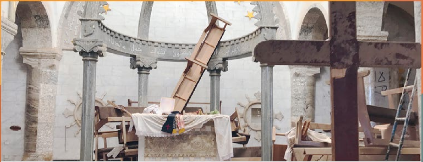
Islamists desecrated many church buildings and other Christian sites, such as this one in northern Iraq. Islamist violence and the wider regional conflict has forced many Iraqi Christians to abandon their historic homeland.

In war-ravaged Syria it is estimated that at least 11 million people, about 60% of the population, are in need of humanitarian aid. U.S. sanctions (known as the Caesar Act) have been criticized for causing further decline and harming those already in desperate need, including Christians.