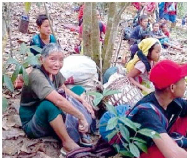
Displaced ethnic-Karen Christians in the jungle of Myanmar.

The deadly artillery assault on the Christian civilians in Karen came suddenly, leaving villagers only moments to escape. A week later, 212 more were displaced from