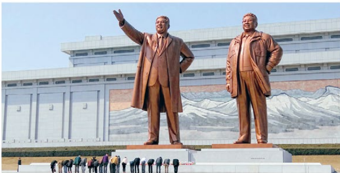
Citizens of North Korea bow before giant statues of former leaders Kim Il-sung and his son Kim Jong-il in the capital city, Pyongyang. Kim Il-sung established the state-propagated ideology of Juche , or human "self-reliance," which is almost like a religion, along with near-worship of Kim Il-sung and his successors.

North Korea is probably the world's most totalitarian state. It is a place of terrible persecution under the despotic rule of President Kim Jong-un – the son of Kim Jong-il – and of strict communist control. Tens of thousands of Christians have been starved, tortured and worked to death in political labor camps, or "re-education" camps, because of their faith. The harshest and most inhumane punishments in such camps are often reserved for Christians.