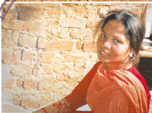
Aasia Bibi gave her testimony of suffering persecution for Christ in Pakistan.

He continued by urging those leaving the conference to “take this message to the four corners of the world. It must not be with arrogance or force, but rather with a love born of God and a humility that comes from the Truth that truly sets us free.”