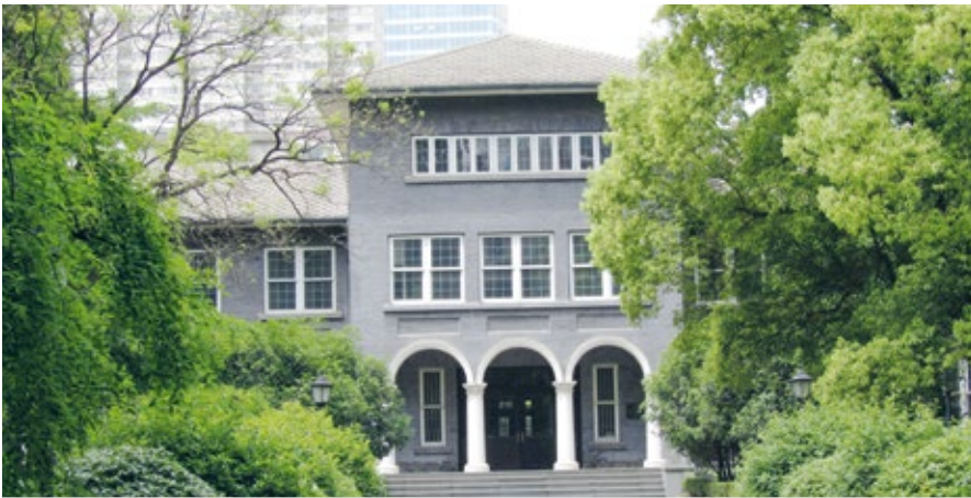
The WeChat page of Nanjing Union Theological Seminary was among those to be suspended. "Nanjing Union Theological Seminary" by 猫猫的日记本 is licensed under CC BY-SA 3.0

China has continued its crackdown on Christian social media content, with the accounts of a number of churches and Christian ministries removed from social media platform WeChat on June 7.