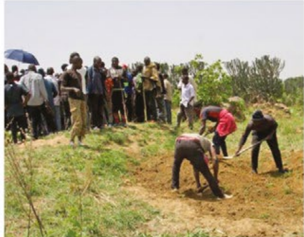
The nine victims of an attack by Fulani militants on Hura village, Plateau state, Nigeria, which included two young children and a pregnant woman, were buried in two graves.

The Islamist militant group Boko Haram, which originated in northeast Nigeria in 2002, has killed countless thousands. One of its main targets are Christians, as it seeks to “cleanse” the territory it controls of all Christians as part of its stated aim to establish a caliphate. Abubakar Shekau, the leader of Boko Haram, died in May, but Islamism remains rife in Nigeria.