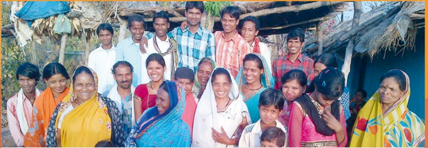
In some Indian states, Christians who share their faith could be reported to the authorities by members of their community. In some areas police are monitoring Christian activities.

a mandatory death sentence for “derogatory remarks” against Muhammad, the prophet of Islam.