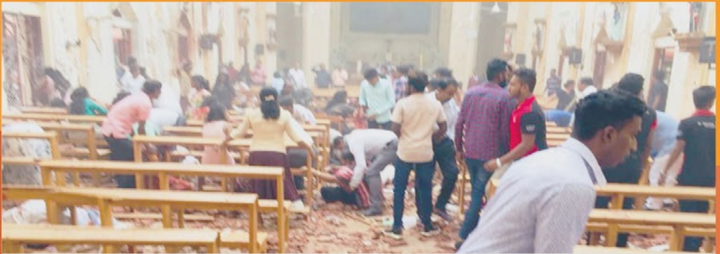
The aftermath of the Easter 2019 bombing in Sri Lanka. This was one of three churches that were attacked, along with three other venues where Christians would gather.

around 95% of church buildings have been destroyed. In May 2020 heavily armed jihadists on motorcycles killed 27 people in three attacks on mainly Christian Dogon villages. In central Mali seven Christians were abducted by Islamists between November 2020 and 2021. They reported being forced to speak in Arabic and recite Islamic prayers in an effort by their captors to force them to deny Christ.