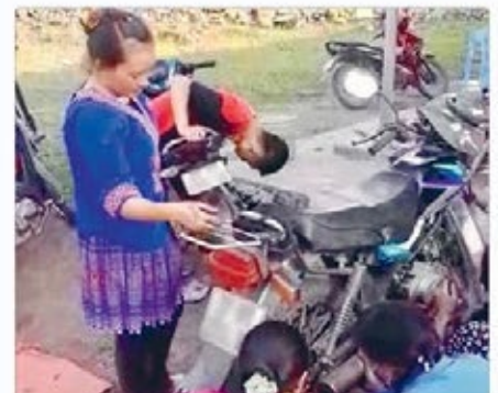
Christians learn the nuts and bolts of motorbike mechanics

Workshops providing training in income-generating skills proved so popular we were asked to repeat them. Forty-two Christians learned motorbike maintenance and received a set of tools to start them in business. Eight women were taught sewing and each given a sewing machine. It is the first time anyone had helped Christians in the locality and they sent repeated thanks to Barnabas supporters.