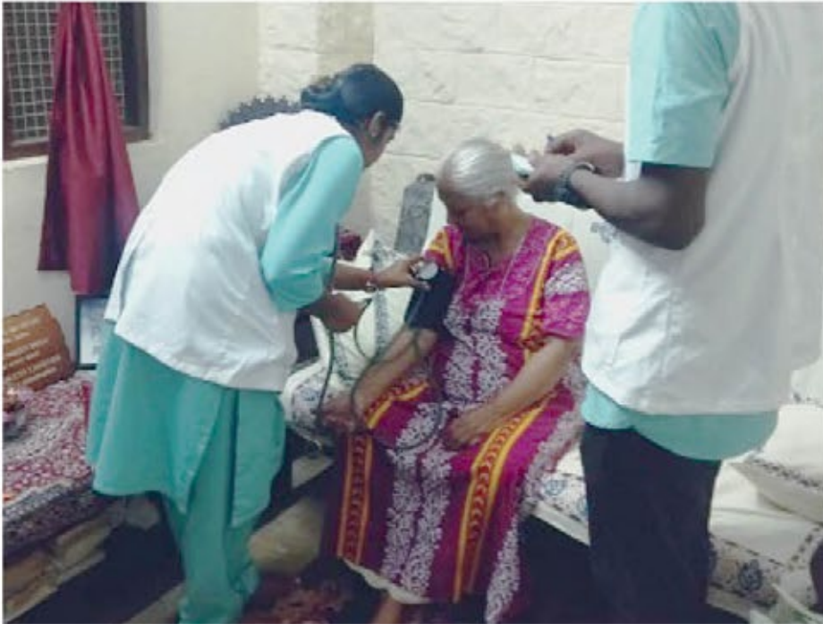
Home healthcare is provided by a Bangalore-based Christian ministry to those with Covid who cannot afford hospital care