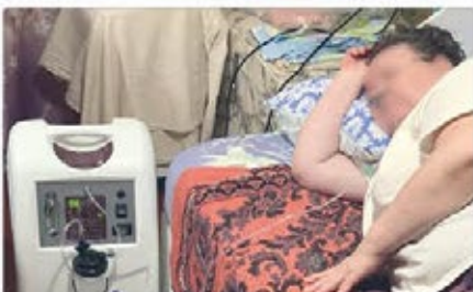
A patient linked to one of the Barnabas-funded oxygen concentrators

A pastor wrote to thank Barnabas supporters. "Through your ministry many people's lives have been saved," he said. "I thank God there are people like you who are not indifferent to the problems associated with the pandemic. Despite the difficult time, you still sacrifice your finances to save people."