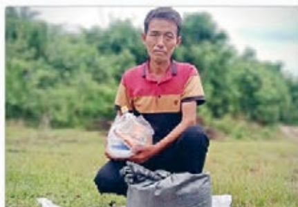
A Christian man receives food from Barnabas to last until the next rice harvest

A Christian said that without Barnabas most families would have had to borrow money at high interest rates or sell what little they possessed.