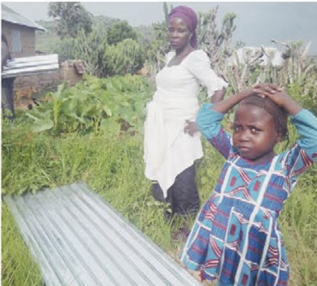
Christians in Kajuru district were among those across Kaduna State, Nigeria, who suffered an onslaught of Islamist violence that killed 300 people and destroyed hundreds of homes in early 2019. Islamist violence throughout Africa continues unabated

In November 2020 the Global Terrorism Index (GTI) reported that the “centre of gravity” for Islamic State (IS – also known as ISIS, ISIL or Daesh) activity had moved from the Middle East to Africa. Africa is experiencing “a surge in terrorism”.