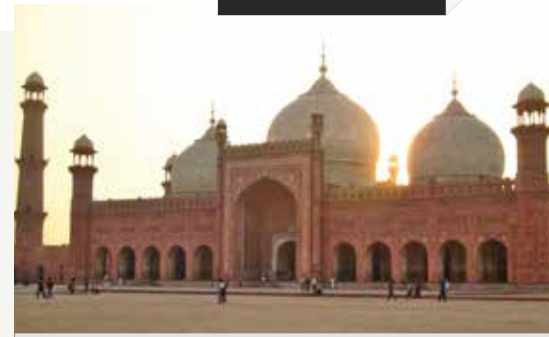
Imperial Mosque, Lahore, Pakistan.