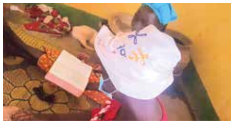
Women spend time together reading one of the Bibles given to them by Barnabas.