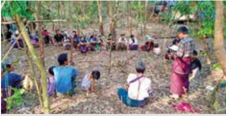
A Barnabas project partner shares the Word of God with displaced believers after a two-week search to locate them in the jungle.

Barnabas project partners have helped fleeing Karen Christians by supplying aid in various locations. Over several months in 2021 the relief network extended to several IDP camps and an estimated 8,500 displaced Karen people who are living along the Thai border. In one camp accommodating about 2,000 Karen Christians, our partners have brought rice, noodles, oil, and other supplies several times.