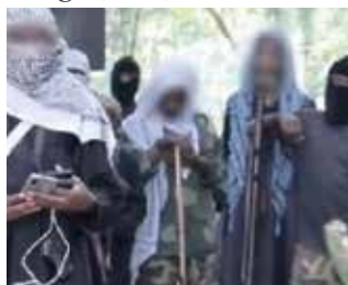
Musa Baluku renews ADF's allegiance to IS

At least a dozen people were killed in an attack by Islamists on the village of Masambo in the north-eastern Democratic Republic of the Congo (DRC).