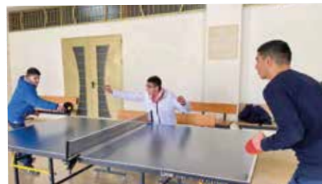
Table tennis games and volleyball matches at recess kept students fit and promoted friendly competition when Covid restrictions meant other sports activities could not be held.

“I feel closer to Jesus every day,” he explains. “I feel He takes care of us and brings us happiness and blessings because we talk to Him every day ... and we pray that Jesus keeps our school safe and becomes bigger and bigger.”