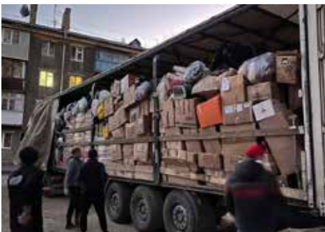
Vital aid from Barnabas supporters about to be unloaded in Ukraine.

Across another of Ukraine's borders, several of our project partners are active in caring for Christian refugees.