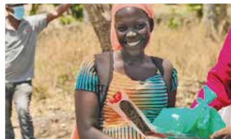
A Christian refugee receives Barnabas-funded tools and seeds.

Our partners prayed with the families whose relatives were affected by recent attacks in South Sudan.