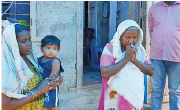
Indian Christians praying. In several Indian states Christians have been subjected to unfounded allegations of carrying out conversions by force, fraud or allurement.

In the same week, however, Indian Christians were encouraged as the country's Supreme Court rejected an extremist group's petition to create a committee to monitor the activities and income of Indian Christian missionaries and local evangelists.