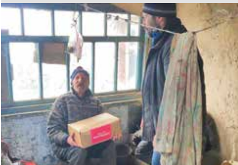
food.gives boxes are reaching the most needy, such as this man in his home in Odesa.

One partner in Moldova provided accommodation for 30 mothers and 60 children. The refugees are accommodated in a Christian camp usually occupied by children. Rooms for about 3-6 persons have been allocated within three large blocks.