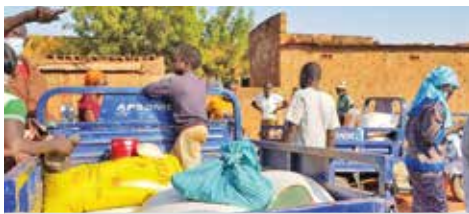
This truck was used first to rescue Christian families and then to bring them food in their new places of safety.