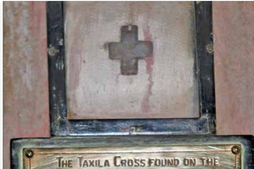
The Taxila Cross was discovered in 1935 at the site of ancient city of Sirkap, near Taxila, modern-day Pakistan. It probably dates from the second or third century, and symbolizes Christianity's heritage in the region. In 1970 it was adopted as the symbol of the Church of Pakistan.

It can be added to the list of Western strategic and moral failures that, when in 2010 NATO's International Security Assistance Force wanted to prove the sharia credentials