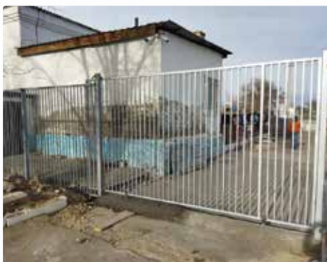
Barnabas provided a protective fence and a CCTV system at the church.

Barnabas funded the purchase of metal fencing, which Christian volunteers installed around the church, and also paid for CCTV cameras around the perimeter as requested by police. Since then, there has been no further stone-throwing (at the time of writing).