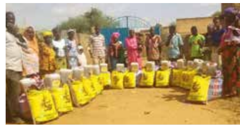
Displaced Christian Fulani families collect Barnabas-funded food aid.

Instead, church volunteers drove, at considerable risk to themselves, through the bush to reach the Christians and discreetly took them to safety. Once at their new, safe destinations the rescued families were given Barnabas-funded food, including maize, rice, spaghetti, tomatoes, cooking oil and salt.