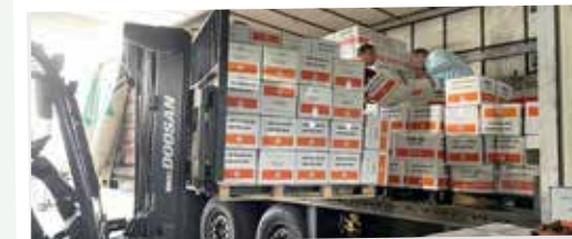
A 40-foot container of dried potatoes is unloaded in Romania, to be sent in smaller vehicles into Ukraine.

Dried potatoes from another 40-foot container that food.gives shipped from Canada are now being distributed in Ukraine.