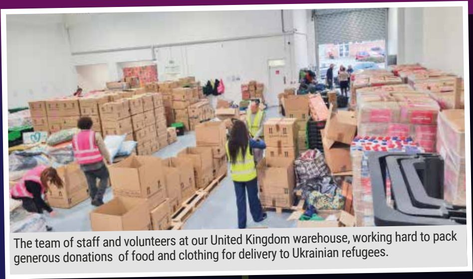
The team of staff and volunteers at our United Kingdom warehouse, working hard to pack generous donations of food and clothing for delivery to Ukrainian refugees.