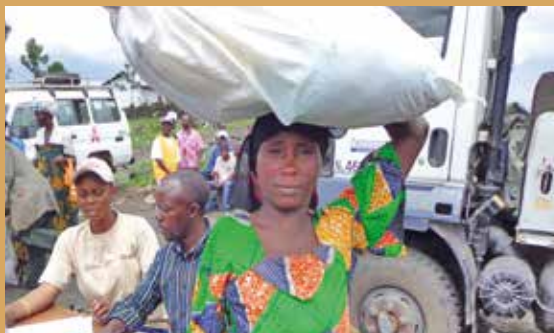
Barnabas-funded food aid is distributed to hungry Congolese Christians.

The mines remain places of violence – church leaders who seek to minister to the miners face fearful reprisals if they are seen to disrupt work. Efforts to reform the sector have led to little, if any change. Much prayer and help is needed for this impoverished, troubled and traumatized land. ■