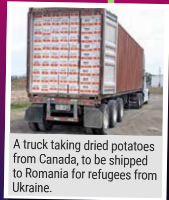
A truck taking dried potatoes from Canada, to be shipped to Romania for refugees from Ukraine.