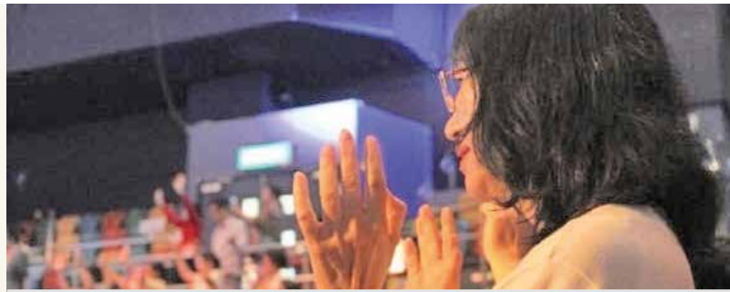
Chinese Christians have more freedom and the Chinese Church is far more resilient that we in the West often realize.

During the Cultural Revolution – the period from 1966 to 1976 in which the Communist authorities attempted by extreme and brutal methods to re-assert Maoism – Mao urged the supporters of communism to destroy the “four olds”: old ideas, old customs, old habits and old culture. Many