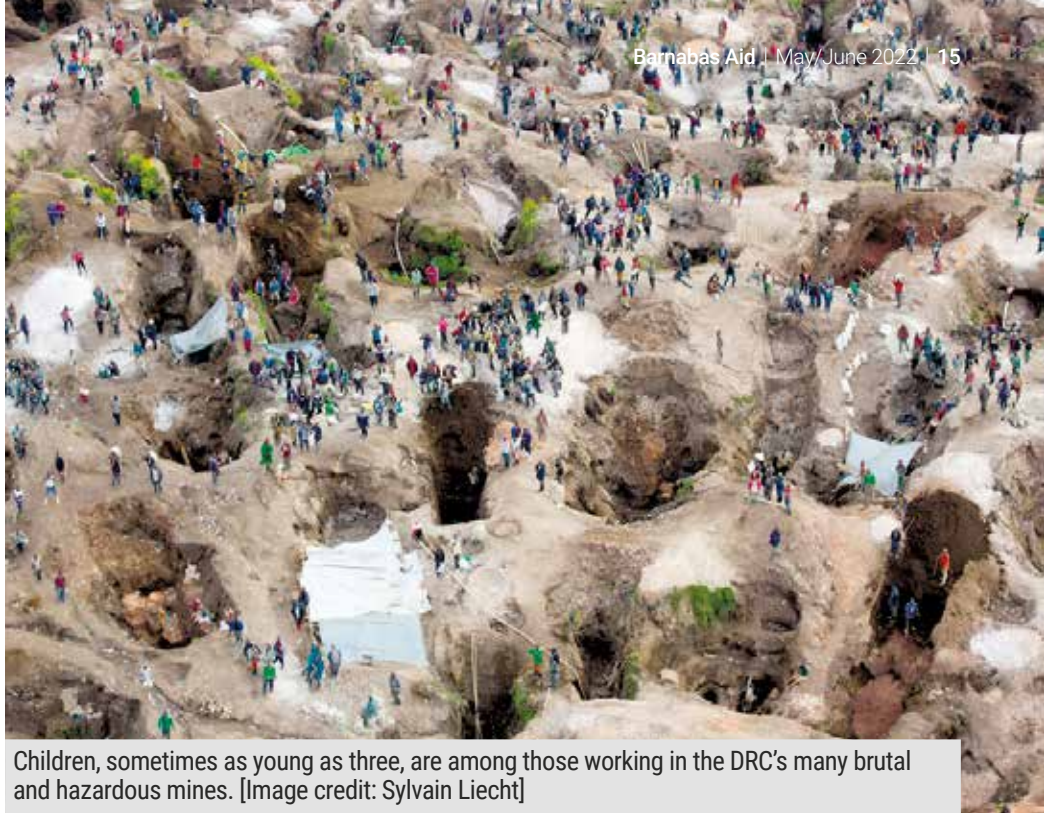
Children, sometimes as young as three, are among those working in the DRC's many brutal and hazardous mines.