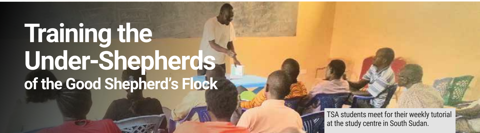
TSA students meet for their weekly tutorial at the study centre in South Sudan.