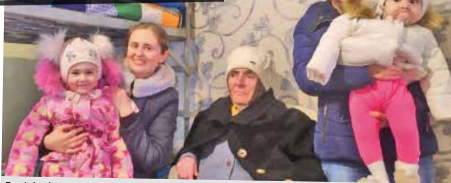
Bunk beds set up in a Sunday school room in Moldova. Churches are using every space to accommodate refugees from Ukraine.

Another gleaning organization in Michigan also supplied a 40 foot container full of dried soup mix, including labels on each packet with cooking instructions translated into Ukrainian. This container was also sent to Romania where our partners distributed the food to refugees in Ukraine and the surrounding area. Further shipments from the U.S. and Canada are planned in the coming months – for as long as they are needed.