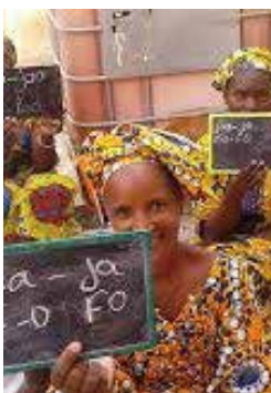
In Senegalese culture, girls often do not have the opportunity to go to school; only boys do. 140 Christian women and 127 men finished the Barnabas-funded literacy program.