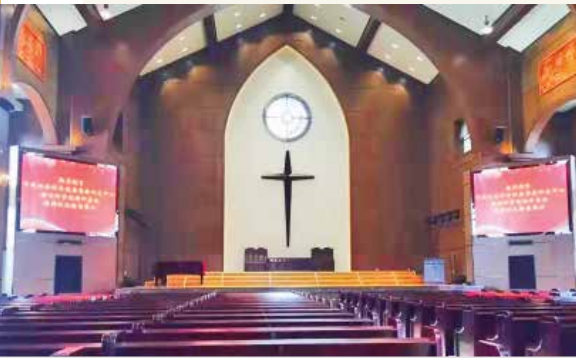
A church building in Beijing. The screens display a message of welcome to visitors. Increasingly churches are required to display on screens or walls quotes from President Xi Jinping.