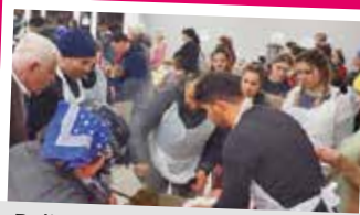
Believers in Moldova providing food for the refugees.