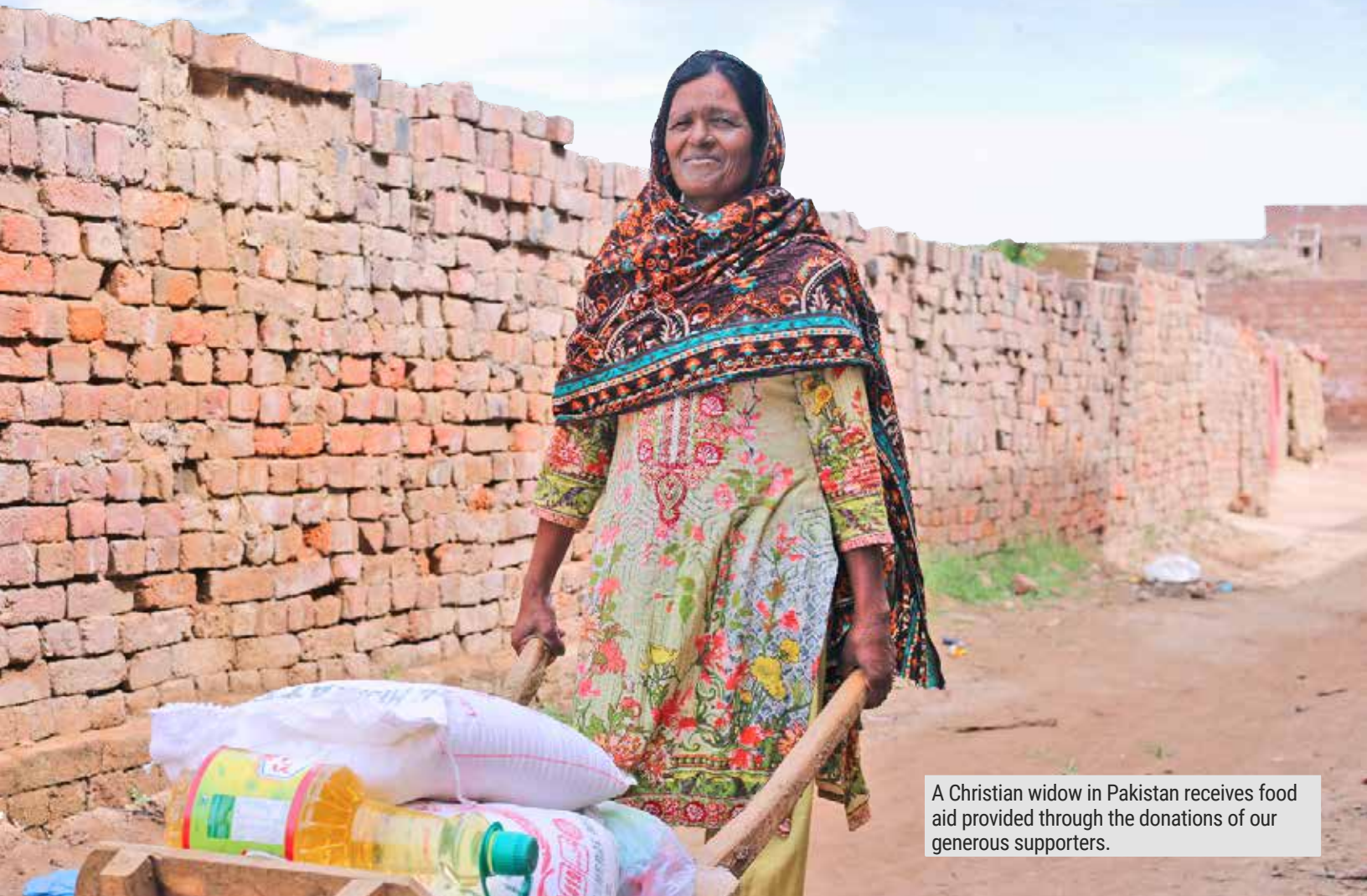
A Christian widow in Pakistan receives food aid provided through the donations of our generous supporters.