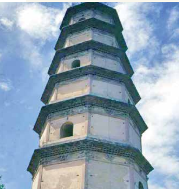
The Daqin Pagoda in Zhouzhi, Xi'an County, Shaanxi Province is a Buddhist monastery. Built over a thousand years ago, some historians believe it to have originally been a Christian church.