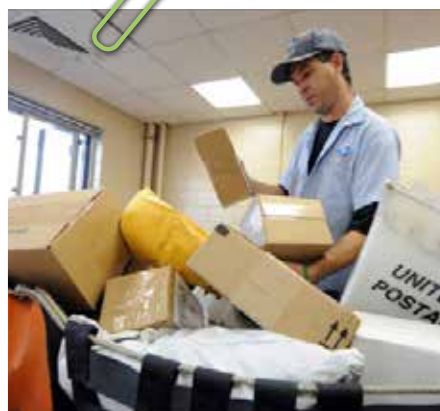
USPS has struggled to keep up with demand because of staff shortages.

We realize that, for some, donating by check is still the preferred method and this is not a problem. Alternatively, if you do have access to our website, why not give it a try? If you have any questions or concerns, contact us by email usa@barnabasaid.org or phone 703 288 1681 .