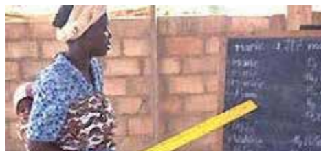
Each of the eight participating churches nominated a Christian to be hired to teach others after agreeing to undertake one week of training.

Another benefit of the program is that it has reduced the seasonal departure of villagers during Senegal’s nine-month dry season. Previously, most would leave to find work in towns. Now villagers are choosing to stay at home to manage their livestock or set up market gardening projects, while maintaining their church activities, because the training has given