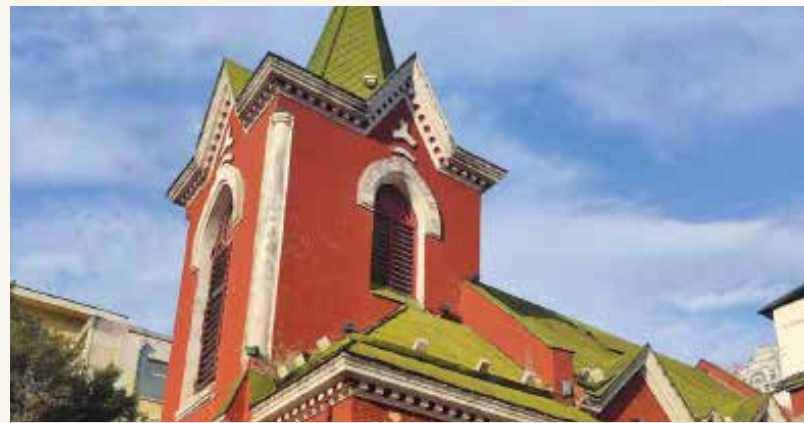
A church building in Harbin, Heilongjiang Province. The church was closed in 1967 during the Cultural Revolution, and only re-opened for worship in 1980.

Buddhism, with origins in Nepal and India, became popular in China during the first century AD. Buddhist teachings further emphasized harmony. Both Taoists and Buddhists in China continued to engage in ancestor worship. Chinese people in general would not regard themselves as belonging exclusively to any one of the three religions, but would draw from all three along with other religious and philosophical ideas.