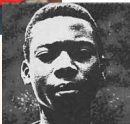
Isidore Bakanja, Belgian Congo (1887-1909)