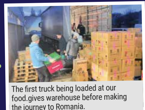
The first truck being loaded at our food.gives warehouse before making the journey to Romania.