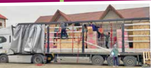
The first truck from the U.K. being unloaded in Romania.