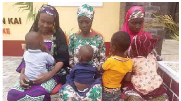
The three rescued Christian women with their children

Boko Haram abducted 276 girls, mostly Christian, from the Government Girls Secondary School, Chibok in April 2014. Around 165 girls have subsequently escaped, been rescued or released. Girls reported being whipped by their captors to force them into marriage, while a group of Christian girls experienced a mock execution for refusing to convert to Islam.