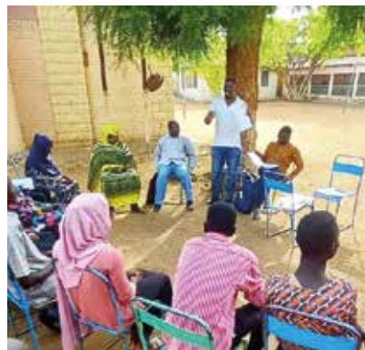
Distance-learning students join together for an open air class

A Bible college part-funded by Barnabas provides tuition for almost 300 students at three campuses, preparing them for ministry. Enrolment numbers have exceeded forecasts for its distance learning programmes. The monthly intensive training sessions it organises for pastors and church leaders have expanded to seven cities, drawing an overall monthly attendance of around 275.