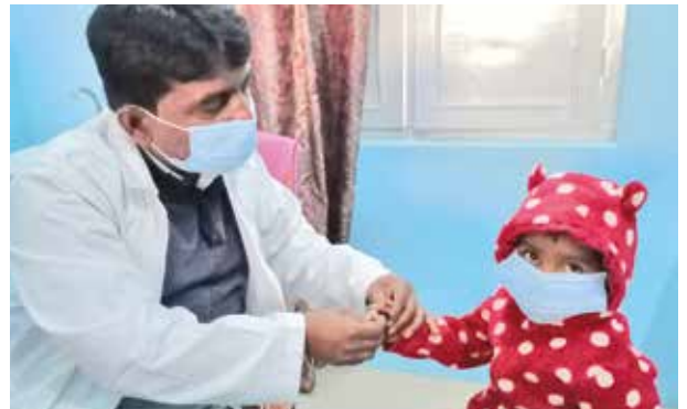
A little girl receives treatment at the Barnabas Hope Clinic

Barnabas is also funding a mobile health clinic that provides free treatment and healthcare advice to impoverished Christian families working in the brick kilns of Punjab, Pakistan. See Barnabas Aid May/June, page 8.