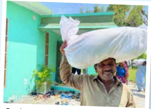
Food and other aid is distributed at a church in Sindh. Thank you for helping us to help our Pakistani Christian family.