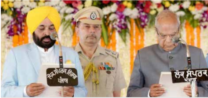
Punjab Chief Minister Bhagwant Mann (pictured during his confirmation ceremony, March 2022) called for the “severest action” to be taken against the attackers

There is a growing number of Christian converts from Sikhism in the village of Thakapura, but no evidence that any of these conversions were the result of force, fraud or allurement.