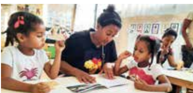
Barnabas-funded therapy sessions help traumatised refugee mothers and their children

Women's group sessions are run by a social worker and enhanced by the traditional Eritrean "Bunah" coffee ceremony. The women are also given therapy individually and in groups of two. Mothers and children take part in weekly therapy together with a clinical psychologist and occupational therapist guiding them.