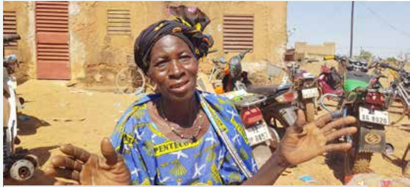
A Christian in Burkina Faso gives thanks for Barnabas-funded aid that was distributed to 152 extra-vulnerable believers threatened by Islamist violence

have been killed by Islamists. Islamist violence is also increasing in the Sahel, with 2022 set to be the