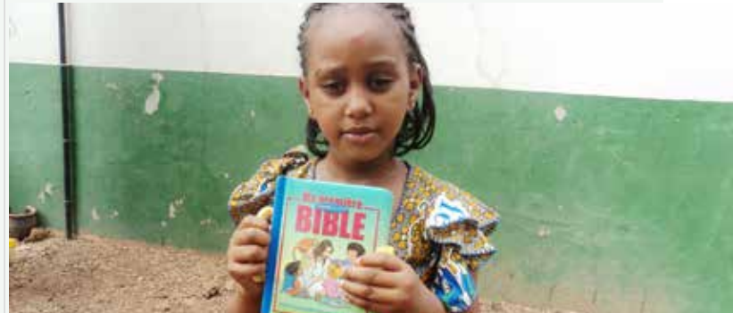
A young believer in Mali receives a French-language children's Bible funded by Barnabas Aid. Mali – along with Burkina Faso, Niger and northern Nigeria – has retained an Islamic culture for many centuries.

Lord Lugard, appointed High Commissioner of British Northern Nigeria in 1900, opted to rule through the existing Islamic structures of governance – the Sokoto emirs – as a means of avoiding conflict, even while southern Nigeria remained under direct British rule. The Islamic character of northern Nigeria was thereby preserved.