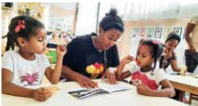
Barnabas-funded therapy sessions help traumatized refugee mothers and their children.

Women’s group sessions are run by a social worker and enhanced by the traditional Eritrean “Bunah” coffee ceremony. The women are also given therapy individually and in groups of two. Mothers and children take part in weekly therapy together with a clinical psychologist and occupational therapist guiding them.