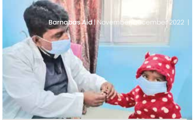
A little girl receives treatment at the Barnabas Hope Clinic.

Barnabas is also funding a mobile health clinic that provides free treatment and healthcare advice to impoverished Christian families working in the brick kilns of Punjab, Pakistan. See Barnabas Aid May/June, page 8.