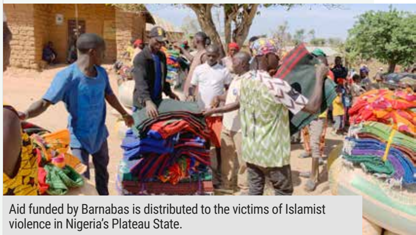
Aid funded by Barnabas is distributed to the victims of Islamist violence in Nigeria’s Plateau State.

The Izala movement provided the ideological and financial basis for the rise of Boko Haram, 3 the Islamist militant group that originated in Maiduguri, north-east Nigeria. Boko Haram gained international attention after the abduction of more than 270 schoolgirls from Chibok, Borno State, in 2014.