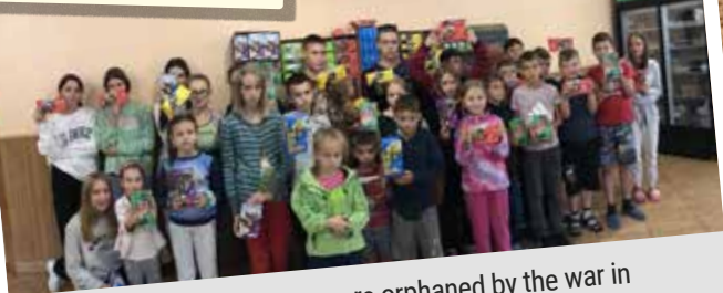
Christian children and teenagers orphaned by the war in Ukraine receive boxes of cookies donated by the Girl Scouts.