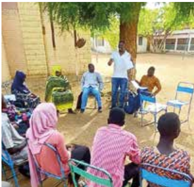
Distance-learning students join together for an open air class.

A Bible college part-funded by Barnabas provides tuition for almost 300 students at three campuses, preparing them for ministry. Enrolment numbers have exceeded forecasts for its distance learning programs. The monthly intensive training sessions it organizes for pastors and church leaders have expanded to seven cities, drawing an overall monthly attendance of around 275.