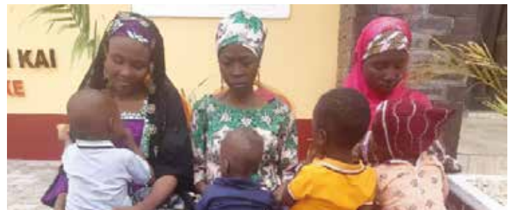
The three rescued Christian women with their children.

Boko Haram abducted 276 girls, mostly Christian, from the Government Girls Secondary School, Chibok in April 2014. Around 165 girls have subsequently escaped, been rescued or released. Girls reported being whipped by their captors to force them into marriage, while a group of Christian girls experienced a mock execution for refusing to convert to Islam.