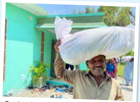
Food and other aid is distributed at a church in Sindh. Thank you for helping us to help our Pakistani Christian family.