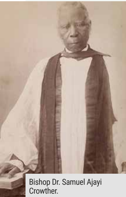
Bishop Dr. Samuel Ajayi Crowther.

IN June 2022 the world's attention was briefly focused on Nigeria, as gunmen – alleged to belong to Islamic State West Africa Province (ISWAP) – attacked a church in Ondo State, killing dozens of Christians. The official death toll stands at 40, though by some estimates the true number of fatalities could be higher than 50.