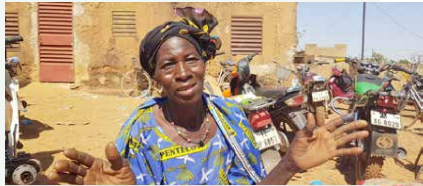
A Christian in Burkina Faso gives thanks for Barnabas-funded aid that was distributed to 152 extra-vulnerable believers threatened by Islamist violence.

Violence against Christians in Nigeria has increased rapidly – since 2015 an estimated 10,000 believers have been killed by Islamists. Islamist violence is also increasing in the Sahel, with 2022 set to be the deadliest year on record in both Burkina Faso and Mali. The withdrawal of