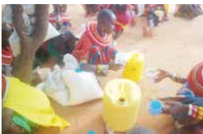
Christian women receive their allocation of Barnabas-funded cooking oil.

A Kenyan Christian missionary said people were joyful as the food was distributed and he heard them whispering in their mother tongue, "God has remembered us." A thankful pastor told Barnabas, "We have nothing to give you, but we ask God to shower you with grace."