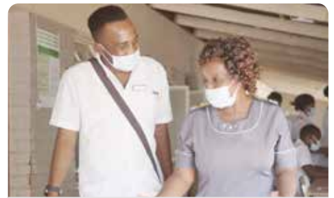
Christian medical workers in Zimbabwe are among those who have received much-needed PPE and other equipment through Barnabas Aid's medical.gives program.

At a time when our economy is struggling, and many of us are facing challenges in our personal finances, medical.gives is one way that you can still help provide for your suffering Christian family.