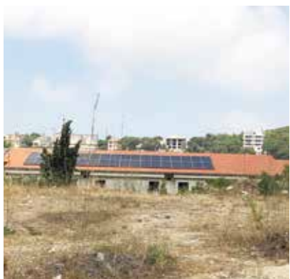
Barnabas-funded solar panels ensure a regular supply of electricity to this Christian elderly care home in Lebanon.

Barnabas is funding the cost of installing solar panels on church-run buildings, including a Christian school and a care home for the elderly. The panels will provide a reliable source of electricity at a much reduced price over the long term.