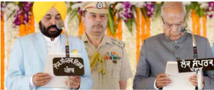
Punjab Chief Minister Bhagwant Mann (pictured during his confirmation ceremony, March 2022) called for the "severest action" to be taken against the attackers.

There are a growing number of Christian converts from Sikhism in the village of Thakapura, but no evidence that any of these conversions were the result of force, fraud or allurement.