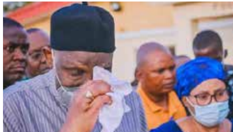
Ondo State Governor Rotimi Akeredolu wept as he visited the church in Owo in the hours following the attack

Gunmen opened fire at a church in Owo, Ondo State on Sunday, June 5, killing at least 40 worshippers.