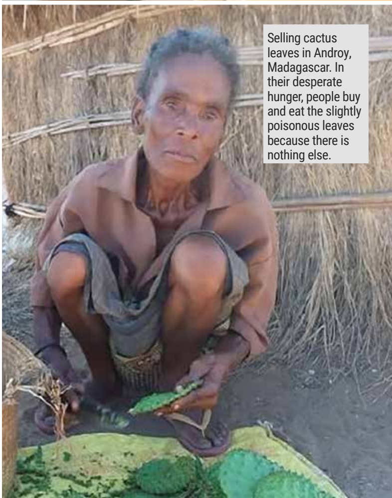
Selling cactus leaves in Androy, Madagascar. In their desperate hunger, people buy and eat the slightly poisonous leaves because there is nothing else.