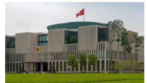
Vietnam National Assembly in the capital, Hanoi. While persecution in Vietnam comes most often from local authorities and communities, central government is usually unwilling to intervene.

Some of the believers have been Christians since 2017 when they found Christ through hearing evangelistic radio broadcasts.