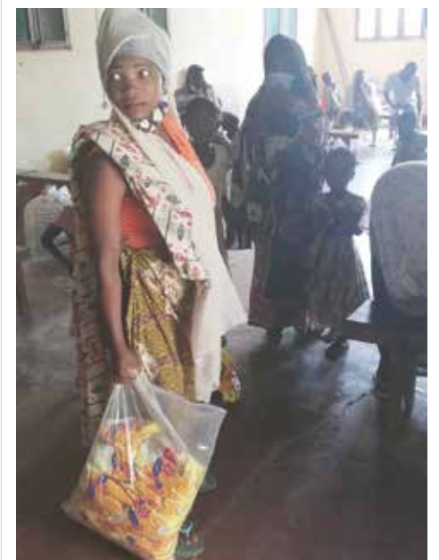
A Mozambican Christian displaced by Islamist violence receives food aid.

In late 2021 Mozambican, Rwandan and South African forces had started to drive the Islamists back. However, the Islamist insurgency now appears to be spreading.