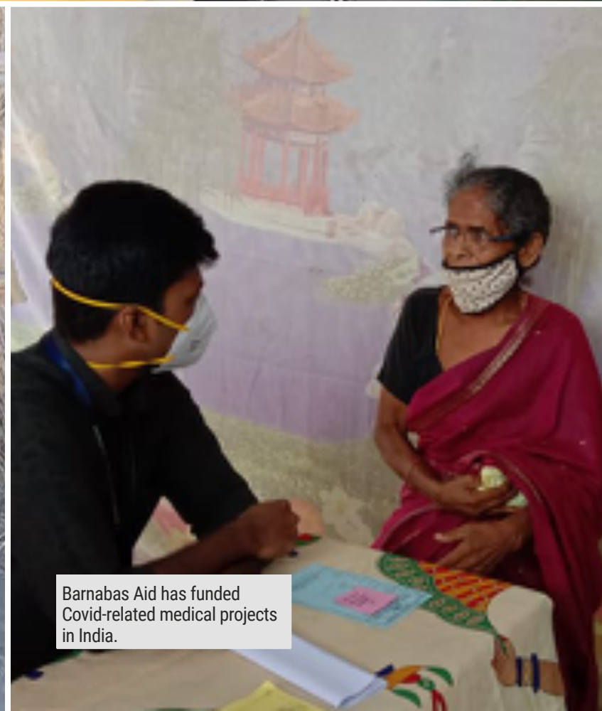
Barnabas Aid has funded Covid-related medical projects in India.