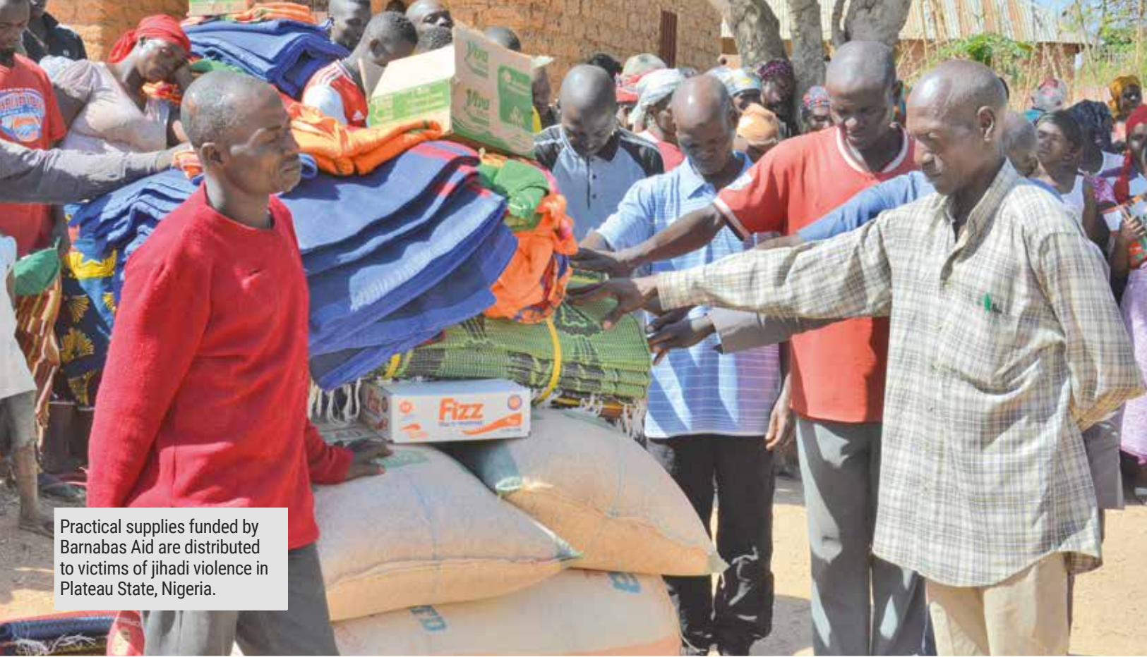
Practical supplies funded by Barnabas Aid are distributed to victims of jihadi violence in Plateau State, Nigeria.