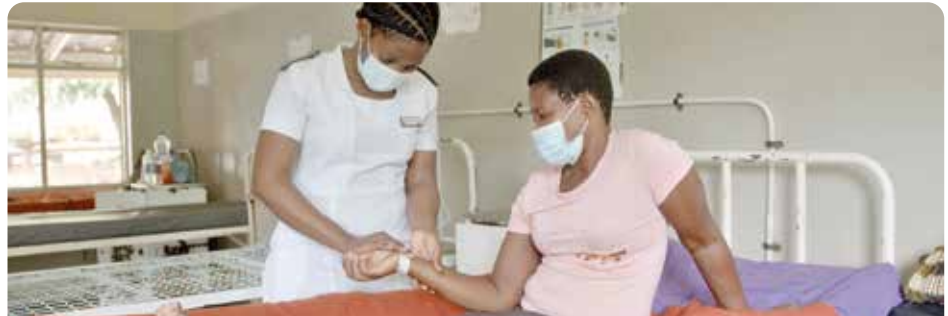
Your generous donations are ensuring that PPE reaches the Christian healthcare workers who urgently need it

Barnabas Aid has also received a substantial donation of medical equipment and work clothing from another Western government, which medical.gives is shortly to transport to Ukraine for Christians fleeing the conflict.