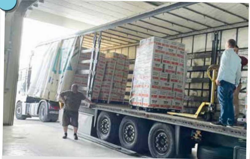
A 40-foot container of dried potatoes is unloaded in Romania, to be sent in smaller vehicles into Ukraine.