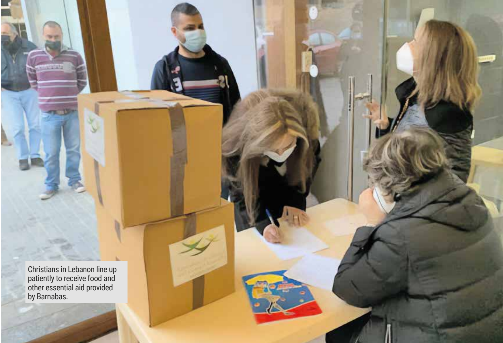
Christians in Lebanon line up patiently to receive food and other essential aid provided by Barnabas.