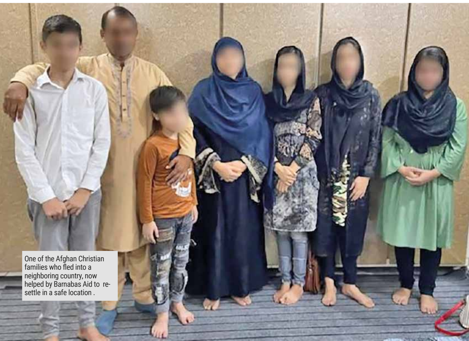
One of the Afghan Christian families who fled into a neighboring country, now helped by Barnabas Aid to re-settle in a safe location .