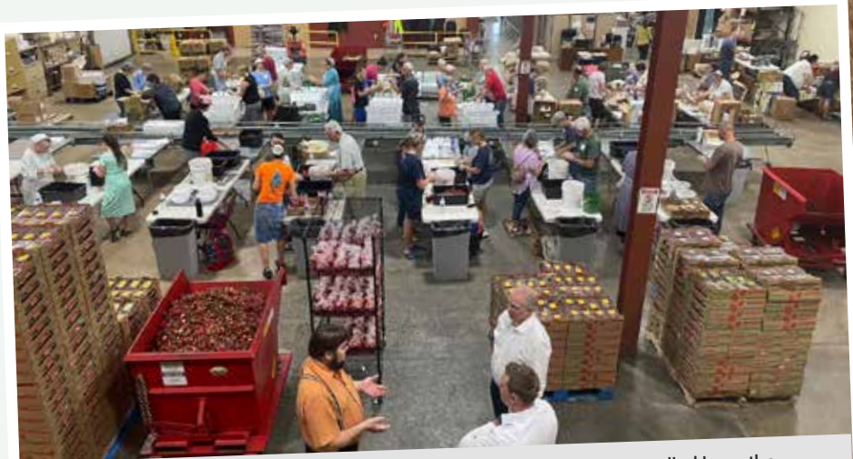
The Blessings of Hope food distribution center in Pennsylvania. Once installed here, the Barnabas-funded food dehydration machine will produce more than 500 tons of dried food each year for distribution around the world.

Barnabas is also partnering with Blessings of Hope to own and put into production a food dehydration machine that will be a vital tool in the fight against food insecurity and hunger.