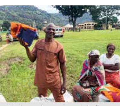
Christians welcome the arrival of Barnabas-funded food and practical aid

We provided food, blankets, mats, mosquito nets and roofing sheets for displaced Christians following attacks in five Christian villages in Kagoro chiefdom, Kaduna State. Fulani extremists had looted the communities, razed homes and displaced thousands of villagers.