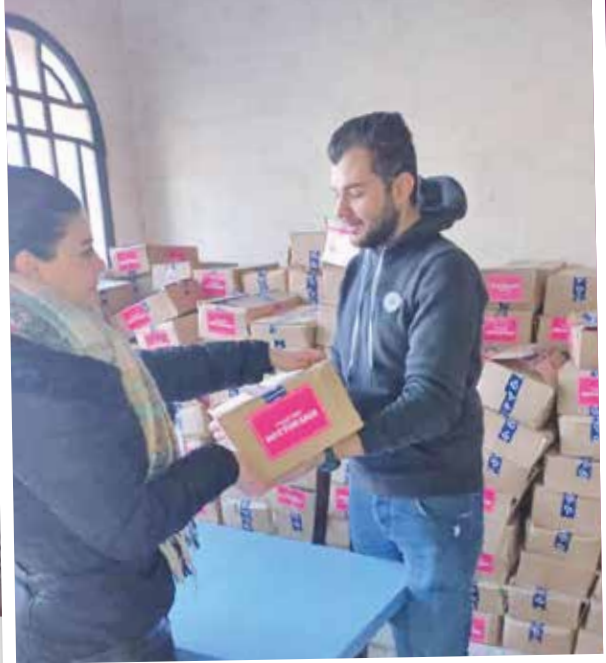
A Christian in Aleppo receives one of 1,500 food.gives boxes distributed within days of the earthquakes

The boxes, given out by our project partners on the ground, contained ingredients for many nutritious meals, including rice, lentils,