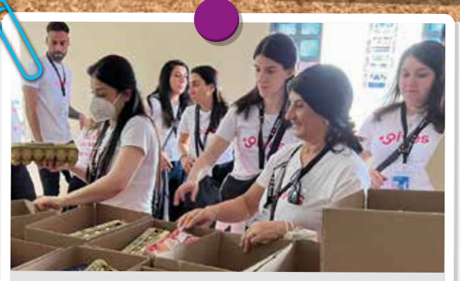
Youth group members worked like "busy bees" filling food gives boxes in Brazil