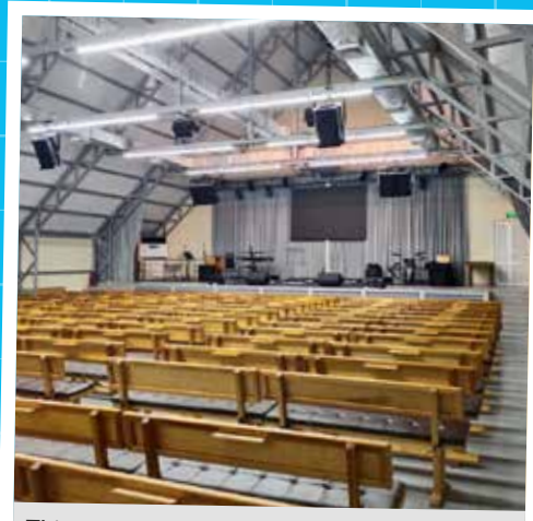
This new Uzbek church building, partially funded by Barnabas, is designed to be easy to dismantle and rebuild

raise the LORD, all you nations . For great is his love towards us, and the faithfulness of the LORD endures forever."