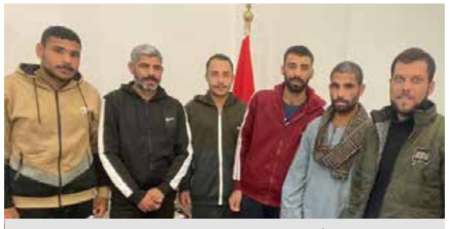
Six Egyptian Christians have been released after being abducted in Libya

Christians are permitted to worship in unregistered buildings pending the completion of the licensing process.