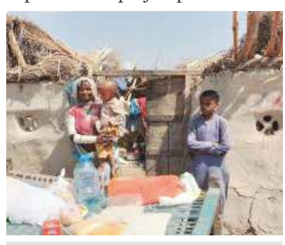
A Christian family with some of the food and practical aid they received from Barnabas

The aid became the "light of hope" for the families in Sindh province, one of the worst-affected areas, and strengthened their faith and trust in God their Provider, explained our project partners.