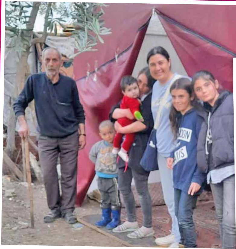
One of the large, heavy-duty tents sheltering Christians in Turkey