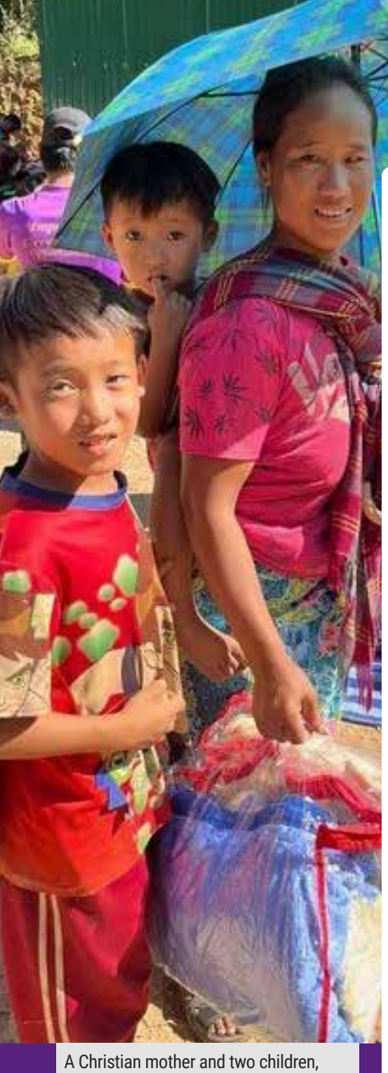
A Christian mother and two children displaced from their home, receive Barnabas-funded food and blankets

The partners shared the Word with the displaced families and prayed with them. These IDPs said that, whilst aid is greatly appreciated, it was the Word of God that encouraged them most.