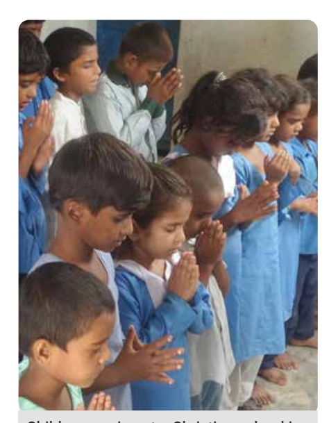
Children praying at a Christian school in Pakistan. Barnabas has helped believers in 109 different countries over the last 30 years

Please join us then, in not only giving thanks for all that God has done in these last 30 years, but also in praying that He will continue to bless and sustain the work of Barnabas as an aid agency to the suffering Church – perhaps for the next 30 years and beyond, however long remains until our Lord's return.