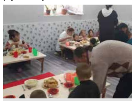
Barnabas funding has helped to provide heating in a rural church so that its dining room is now a comfortable space for meals and children's activities

Most of the congregation are converts from Islam. Many are pensioners because young, able-bodied people leave the area in search of work. As a result the church barely has enough to pay its utility bills.