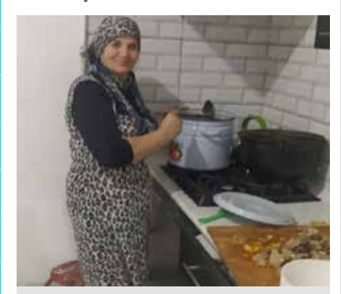
Barnabas funding has enabled hot water to be provided in a rural church's newly refitted kitchen

These opening verses of Psalm 117 were chosen by a congregation in Uzbekistan to give thanks to God for the construction of their new church building, partly funded by Barnabas.