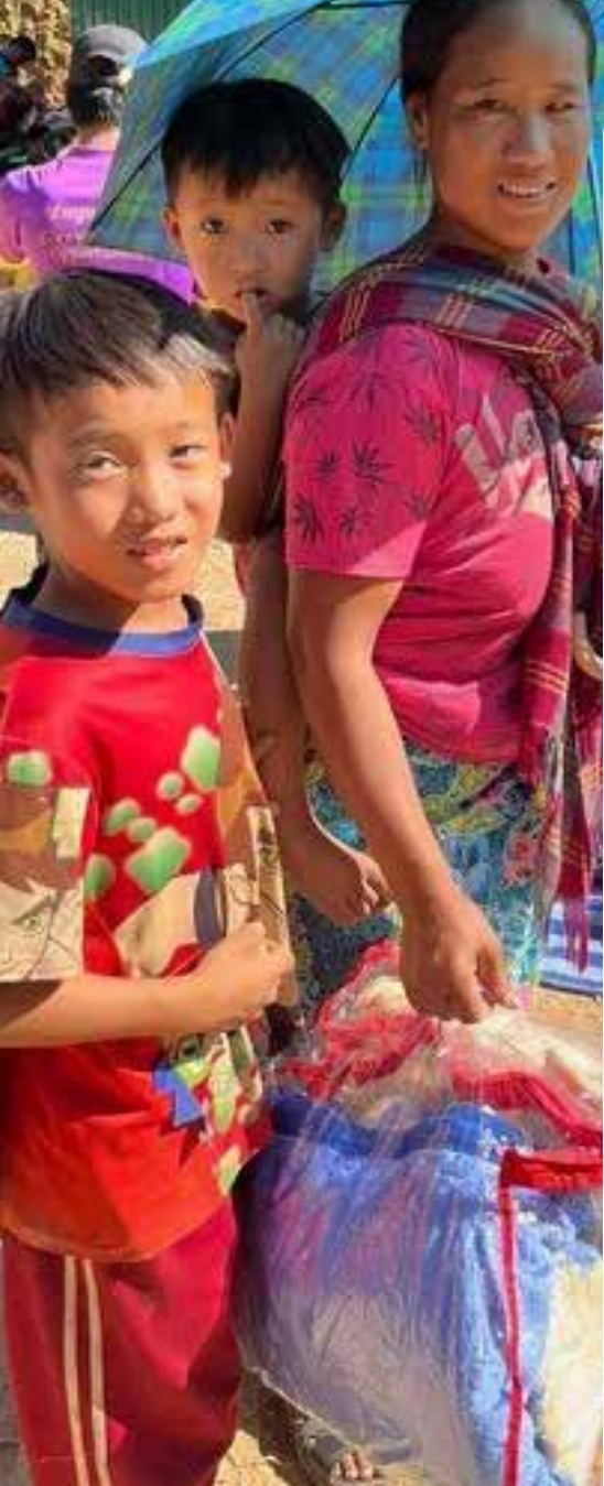
A Christian mother and two children, displaced from their home, receive Barnabas-funded food and blankets

“ T he Myanmar military came into our village and started shooting big guns ... They burned down our entire village. Besides this, they also attacked us by air with war planes shooting and bombing our areas.”