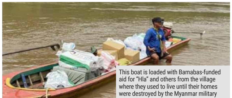
This boat is loaded with Barnabas-funded aid for “Hla” and others from the village where they used to live until their homes were destroyed by the Myanmar military

The partners shared the Word with the displaced families and prayed with them. These IDPs said that, whilst aid is greatly appreciated, it was the Word of God that encouraged them most.