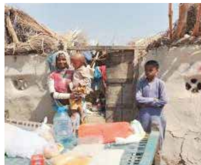
A Christian family with some of the food and practical aid they received from Barnabas

The aid became the “light of hope” for the families in Sindh province, one of the worst-affected areas, and strengthened their faith and trust in God their Provider, explained our project partners.