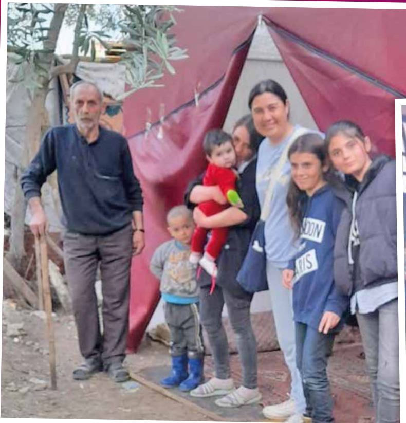
One of the large, heavy-duty tents sheltering Christians in Turkey