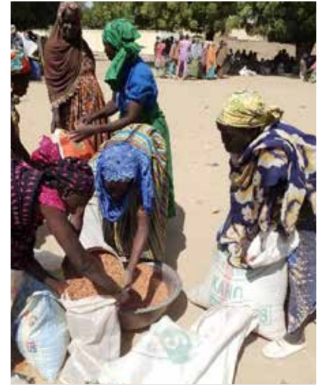
Women in Cameroon carefully share out grain into 50kg sacks