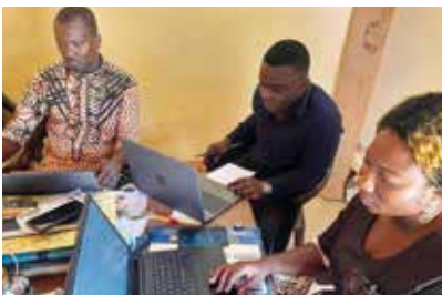
Translators work on the Flame language draft of Judges

Project reference: 00-362 (Bibles and Scriptures Fund)