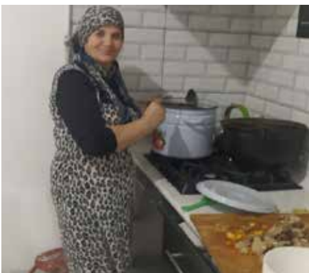
Barnabas funding has enabled hot water to be provided in a rural church's newly refitted kitchen

These opening verses of Psalm 117 were chosen by a congregation in Uzbekistan to give thanks to God for the construction of their new church building, partly funded by Barnabas.