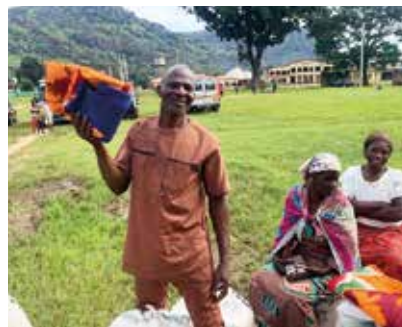
Christians welcome the arrival of Barnabas-funded food and practical aid

We provided food, blankets, mats, mosquito nets and roofing sheets for displaced Christians following attacks in five Christian villages in Kagoro chieftdom, Kaduna State. Fulani extremists had looted the communities, razed homes and displaced thousands of villagers.