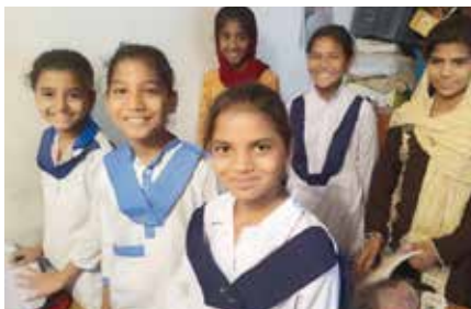
Supporting Christian schools – such as this one in Pakistan – is just one of the ways in which Barnabas Aid is sharing out the Lord's blessings

In the 12 months from 1 November 2021 to 31 October 2022, Barnabas funded 8,746 small business livelihood projects for around 43,730 Christians. We provided schooling for 10,405 children in 126 Christian schools, as well as training 1,451 apprentices and funding other vocational training.