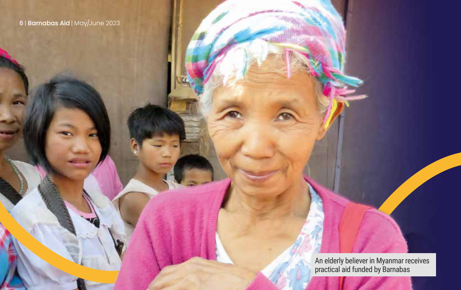
An elderly believer in Myanmar receives practical aid funded by Barnabas