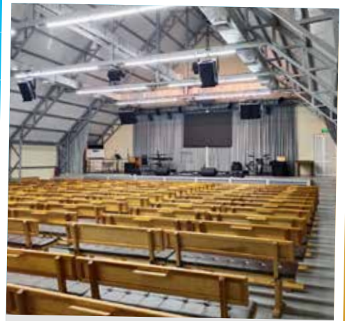
This new Uzbek church building, partially funded by Barnabas, is designed to be easy to dismantle and rebuild

P raise the LORD, all you nations ... For great is his love towards us, and the faithfulness of the LORD endures forever.”