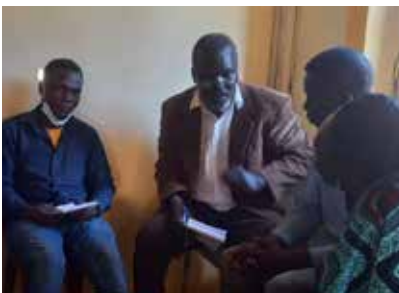
Sudanese students take part in group discussions as part of their pastorship training

Another 140 students have used the college teaching materials to train 3,300 leaders and members in their home churches. This is helping to strengthen the country’s small Christian community, persecuted for many decades by the Muslim majority.