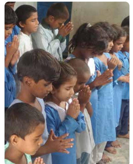
Children praying at a Christian school in Pakistan. Barnabas has helped believers in 109 different countries over the last 30 years

Please join us then, in not only giving thanks for all that God has done in these last 30 years, but also in praying that He will continue to bless and sustain the work of Barnabas as an aid agency to the suffering Church – perhaps for the next 30 years and beyond, however long remains until our Lord's return.