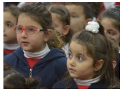
Kindergarten children begin their school journey in the safe and secure Christian environment at St Aphem's