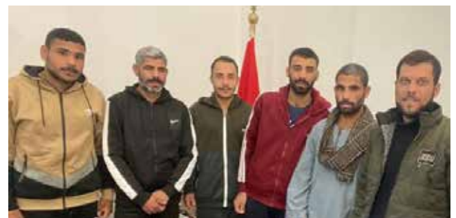
Six Egyptian Christians have been released after being abducted in Libya

Christians are permitted to worship in unregistered buildings pending the completion of the licensing process.