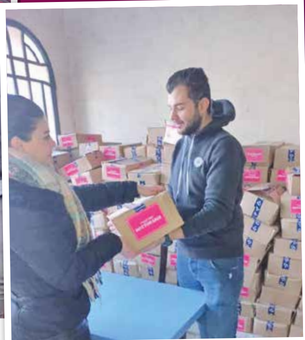
A Christian in Aleppo receives one of 1,500 food.gives boxes distributed within days of the earthquakes

The boxes, given out by our project partners on the ground, contained ingredients for many nutritious meals, including rice, lentils,