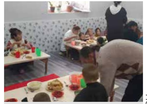
Barnabas funding has helped to provide heating in a rural church so that its dining room is now a comfortable space for meals and children's activities

Most of the congregation are converts from Islam. Many are pensioners because young, able-bodied people leave the area in search of work. As a result the church barely has enough to pay its utility bills.