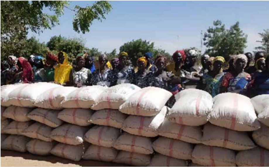
Bags of Barnabas-funded maize ready to be distributed to Cameroonians in need