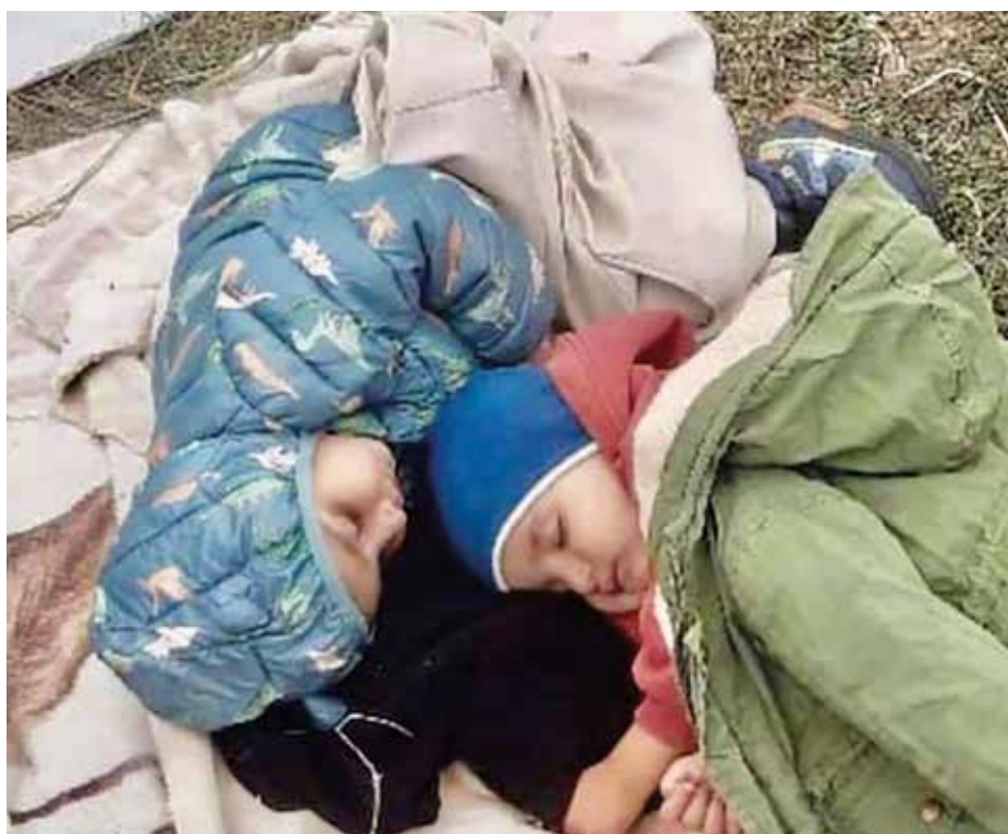
Armenian Christian children among the thousands displaced from Nagorno-Karabakh