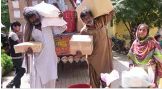
Christian victims of the violence pick up Barnabas-funded food, hygiene supplies and household equipment

washing powder, women's sanitary pads and two plastic buckets and two mugs.