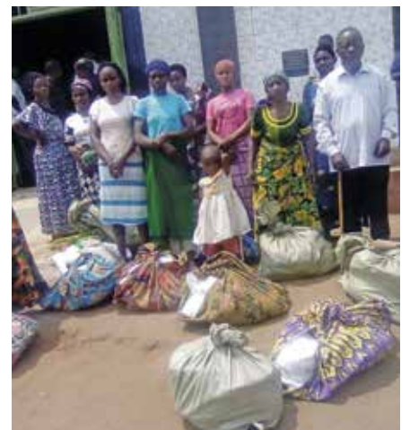
Vulnerable members of the Ugandan Christian community around the school collect bundles of Barnabas-funded food aid

“Keep praying for me to get healed and go back to school,” he requested. “My ambition is to finish school and work for the community.”