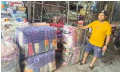
A Moroccan church leader coordinates the delivery of Barnabas-funded blankets to survivors