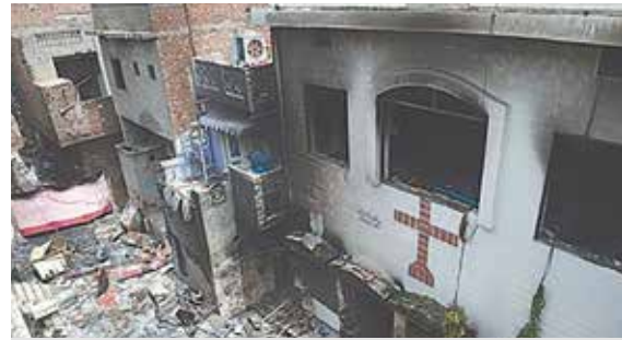
Debris litters the street outside one of the churches attacked in Jaranwala

“We highly appreciate that Barnabas Aid stood side by side with us in our hard times and gave us hope and feelings that our big global family in Christ always cares for us.”