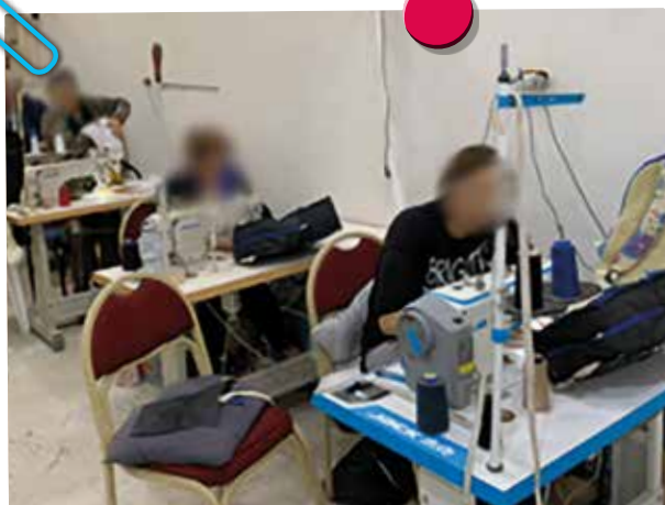
Egyptian Christian women receive Barnabas-funded training in sewing

Please give a gift to our Egyptian church family on Giving Tuesday via our website barnabasaid.org , by post (address on inside front cover) or by phone on 0800 587 4006 quoting the project reference 11-226 (Small business start-ups in Egypt).