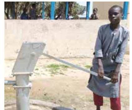
A young Christian refugee draws water from a Barnabas-funded borewell

Barnabas funded the drilling of two boreholes on church land close to the camp that produce clean water, so the families are no longer sick. The boreholes also mean the women no longer have to risk walking a long distance from the camp to draw water. They thanked God for "this testimony of love".