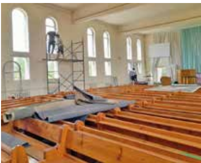
New windows help to keep out the bitter cold