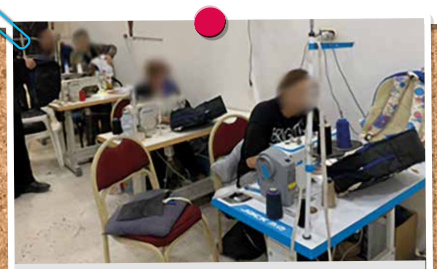
Egyptian Christian women receive Barnabas-funded training in sewing

Please give a gift to our Egyptian church family on Giving Tuesday via our website barnabasaid.org, by post (address on inside front cover) or by phone on 0800 008 805 quoting the project reference 11-226 (Small business start-ups in Egypt).