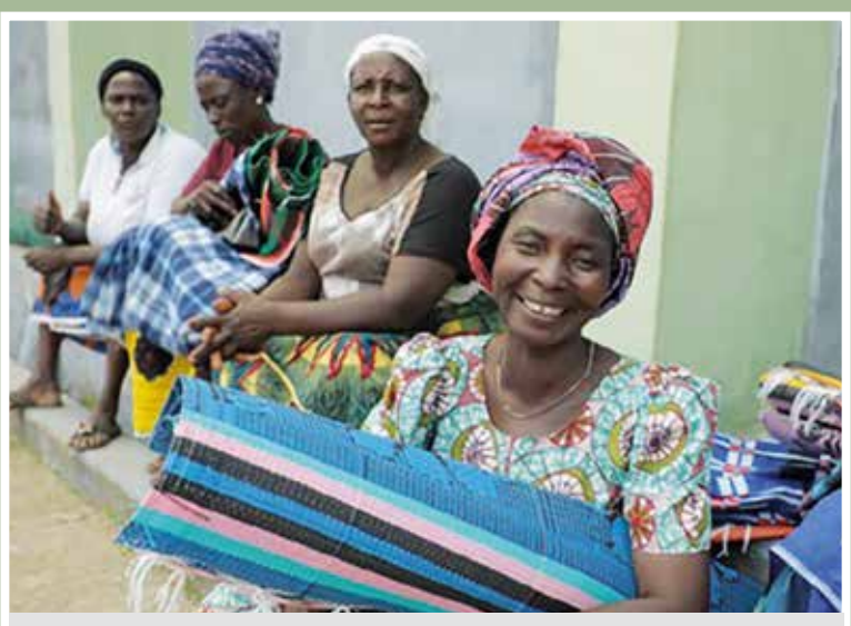
Christian women receive sleeping mats and blankets in the latest Barnabas-funded distribution of aid to Nigerian victims of violence

"Though the government here refused to assist the people, God has sent help from above through Barnabas Aid."