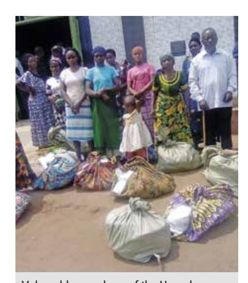
Vulnerable members of the Ugandan Christian community around the school collect bundles of Barnabas-funded food aid

"Keep praying for me to get healed and go back to school," he requested. "My ambition is to finish school and work for the community."