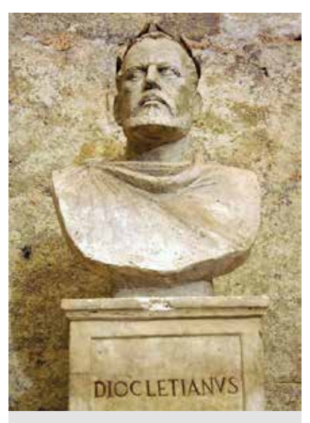
Emperor Diocletian

destroyed. Christians in public service were demoted and deprived of their civil rights. Christian freedmen were made slaves again, which meant they could legally be tortured. The day before issuing this edict, Diocletian had ordered that a church building in Nicomedia, near to the imperial palace, be razed to the ground and its Scriptures burned.