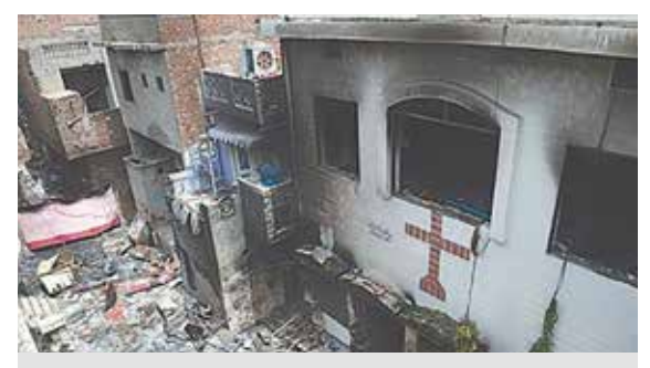
Debris litters the street outside one of the churches attacked in Jaranwala

"We highly appreciate that Barnabas Aid stood side by side with us in our hard times and gave us hope and feelings that our big global family in Christ always cares for us."