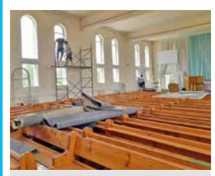
New windows help to keep out the bitter cold